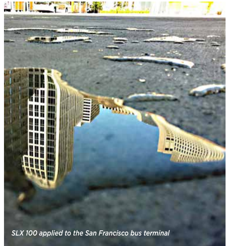
SLX 100 applied to the San Francisco bus terminal