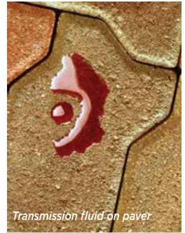
Transmission fluid on paver