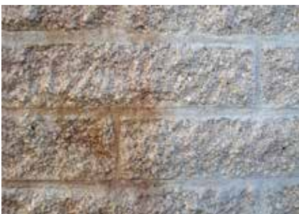
Rust on concrete block