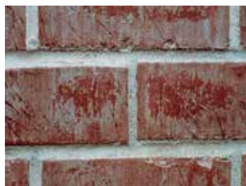
White scum on brick