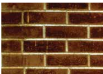
Acid burn on brick