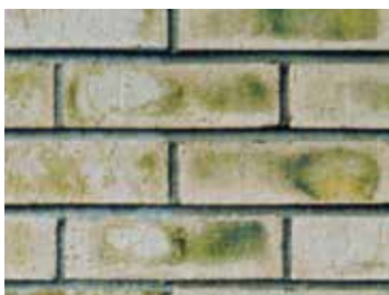
Green vanadium on light brick