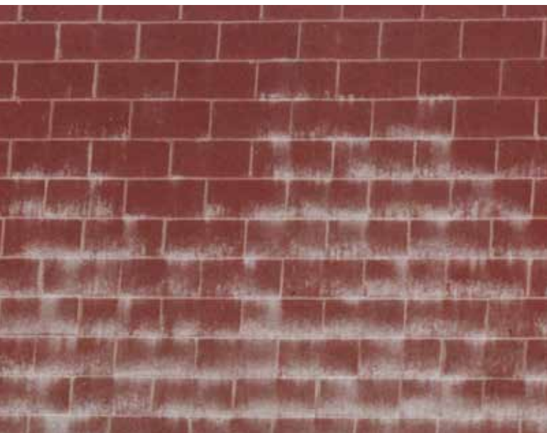
Efflorescence on concrete block