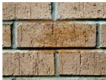
Brown manganese on brick