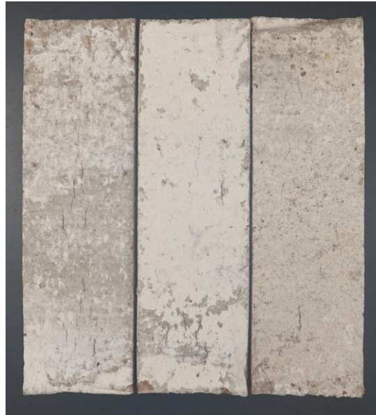
“Cheswick” Modular Brick