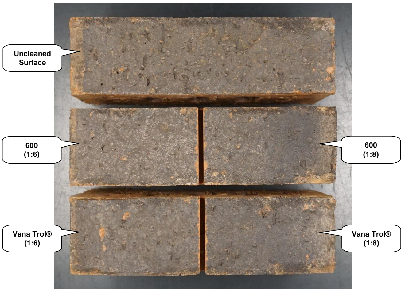
"Buffalo Trail" Facebrick After Cleaning